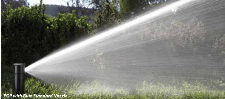
PGP with Blue Standard Nozzle

Only the PGP provides excellent coverage both close to the sprinkler as well as throughout its full distance of throw. The exceptional performance of PGP nozzles guarantees uniform results with no wet or dry spots in all head-to-head spacing installations from 20 to 45 feet. And because the nozzles are easily interchanged and adjusted, the installer can easily fine tune watering to meet field conditions.