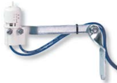
Mini-Clik Rain Sensor

T here's nothing more embarrassing—or more wasteful or costly—than an irrigation system that runs when it doesn't have to...in the rain. Mini-Clik ® provides the simplest, most effective way to prevent sprinklers from coming on during or after precipitation. It easily installs on any automatic irrigation system, then shuts sprinklers off in a storm and keeps them off, automatically compensating for the amount of rainfall that occurred. Disks absorb water and expand proportionally to the amount of rain that fell (e.g., a